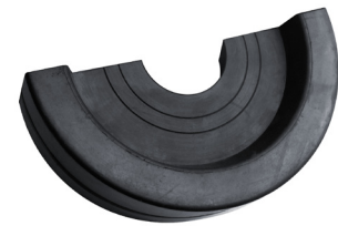
② Cut the bushes in half using the cut grooves