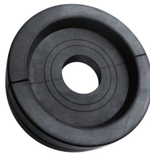
① Drill the pipe diameter first