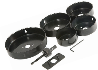
① Hole-saw kit